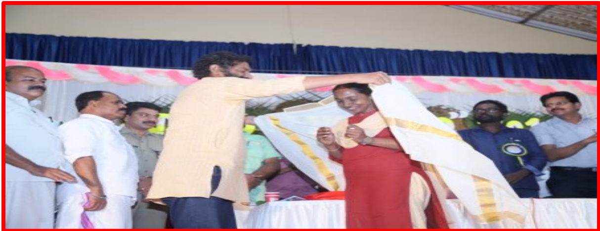
Honouring the young Poets