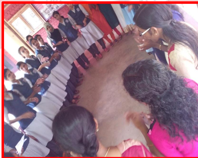
III B.Com Singing Nadanpattu...